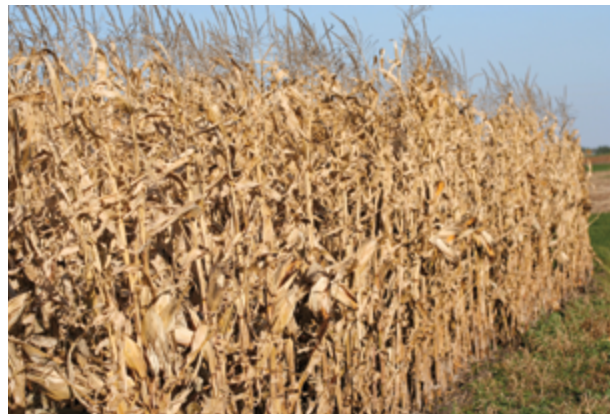
Figure 4.1 Field records of current and prior pest populations can be used to assess current and future risks. This image shows a cornfield with very few pests.