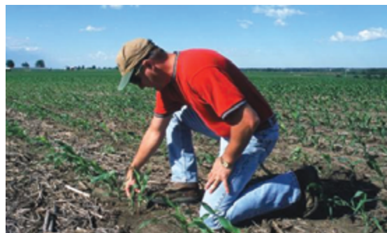
Figure 4.2 Scouting a field.

Corn production costs can exceed $500/acre or $80,000 for a quarter section. To ensure that these resources are well-invested, fields are routinely scouted to identify problems (Fig. 4.2). This information is compiled can be used as a benchmark for identifying successes and failures. Although rarely discussed in achieving high yields, we believe that maintaining accurate records is a critical step in optimizing yields. Field records should include information about field productivity, previous soil test information and fertilizers applied, historical information, and insect and weed pest management history.