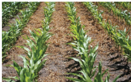
Figure 4.4 Cornfield with high weed pressure.

The weed-control management history provides a picture of previous and potential problems (Fig. 4.4). Past records of weeds and their associated control reveal information about what worked and what did not work. Weed records can also be used to identify herbicide resistance. Increasingly, chemical companies are reformulating old chemistry into “new” products. Therefore, record the trade name as well as the common name of the active ingredients and mode of action. To reduce the risk of developing pest resistance, avoid using compounds with similar modes of action.