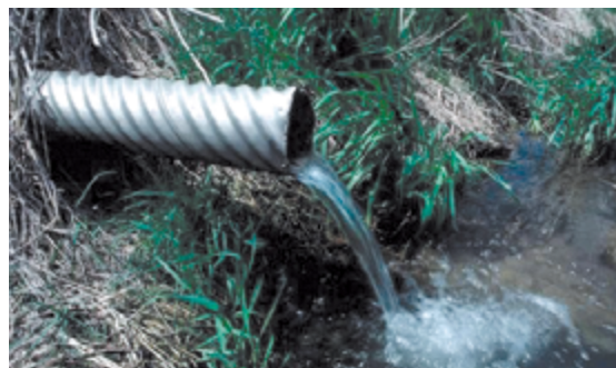
Figure 30.1 Water flowing from the outlet of a subsurface drain.

Approximately 25% of the farmable acres in the U.S. have some form of artificial drainage. Subsurface (tile) drainage is used to remove excess soil water and salts using drainage pipes or tiles installed below the soil surface (Fig. 30.1). Since the 1970s, perforated polyethylene tubing has become the most popular material for drainage pipes. Historically, cylindrical clay or concrete sections, or "tiles," were used, so the customary terms "tiling" and "tile drainage" are still used to describe subsurface drainage. Drains typically are installed below the root zone at depths ranging from 2.5- to 4-feet. The drain line outlets generally are streams or open ditches.