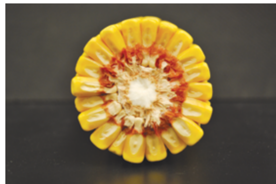
Figure 38.2 Count the number of rows. On this ear, there are ~20 kernels per row.

Step 4. Estimate the number of kernels/bu. The mass/kernel of corn varies greatly (see Chapter 36, Table 36.2). The number of kernels/bu can range from 70,000 kernels/bu to 105,000 kernels/bu (assume a bushel to be 56 lbs at 15.5% moisture). The kernel weight is very sensitive to climatic conditions between August and September. During wet conditions, a bushel may contain 70,000 kernels, whereas if August and September are hot