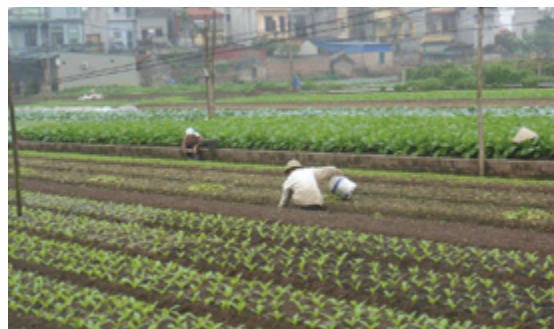
Figure 44.3 Carefully tended cropping areas in Vietnam display minimal weed problems.

Hand-hoeing is a time-tested approach to control weeds. However, the practice is often overlooked in organic production fields because of cost and labor requirements. Notwithstanding, new infestations of a weed, control of within-row weeds, or control of scattered plants may warrant individual attention. Weed seeds can last in the seed bank for 3 to 50 years, and one weed can produce several hundred to several hundred thousand seeds. "An ounce of prevention, can be worth pounds of cure" – through careful management, weeds can be controlled (Fig. 44.3).