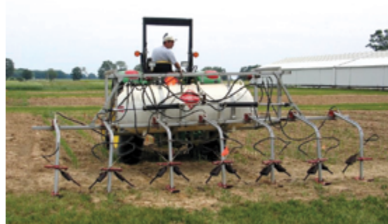
Figure 44.4 An image of a propane flamer.

Flaming, steaming, and microwave systems have been used to kill weeds through desiccation and high-temperature exposure (Fig. 44.4). Young weeds (and germinating seeds, in some cases) can be killed quite readily with these practices. Larger weeds need to be treated for a longer period of time and the growing point must be affected. The problem with these methods is that the contact time needs to be optimized, often leading to slow operating speeds for equipment, low labor efficiency, and high fuel bills. Caution must be taken because crops can be sensitive to the heat as well. Typically, corn can withstand the heat if the growing point is below the soil surface, but care must be taken not to directly heat the crop, once the growing point is above ground.