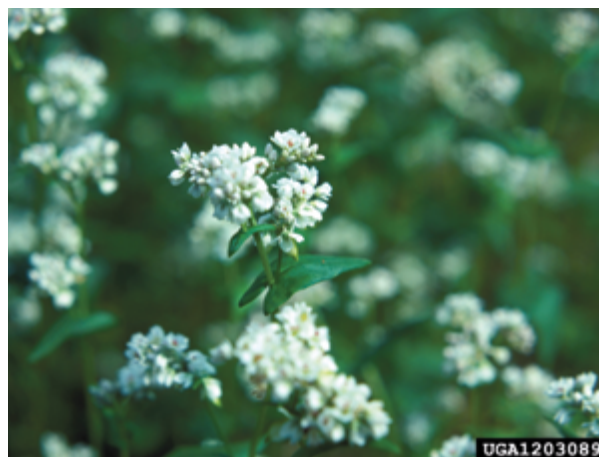
Figure 44.1 Buckwheat can be used as a smother or cover crop in organic systems to aid in weed management