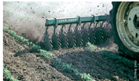
Figure 44.2 Rotary hoe operation to remove small weeds.

Many types of cultivation implements are available and may be used once or many times during the season. Cultivation provides a clean seedbed and can be used to provide immediate control of weeds between the rows. In the Midwest, two or three cultivations are typical for organic corn grain systems. Timing for all cultivation operations is critical, and it may take several years to establish optimal timing for weed control in your fields. However, complacency and performing the same operation at the same time every year will result in a spread of species other than those that were originally problematic. Rotary hoeing and harrowing can be used if the corn and weeds are not too large (that is, weeds at the white-thread stage). Rotary hoeing on a diagonal, rather than up and down the rows, at 10 to 12 mph is purported to provide the greatest weed control.