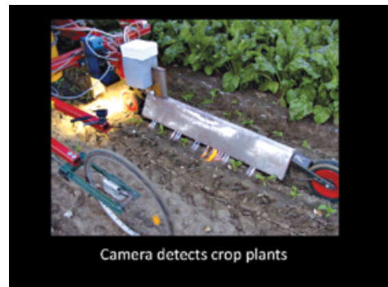
Figure 44.7 A “smart” flame weeder that uses sensors to detect weeds in the interrow of transplanted crops. Note that some areas are being flamed and other areas are not.