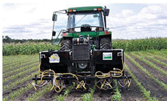
Figure 44.5 Four-row grit applicator for weed control in row crops designed by SDSU Ag & Biosystems Engineering Dept. (Dan Humburg and Corey Lanoue) Ground corncob grit was used as the spray.

Abrasive-grit systems are being tested by SDSU, the University of Illinois, and USDA-ARS for their ability to control weeds (Fig. 44.5). The machine uses organically certified grits (walnut shells, corncobs, soybean meal, pelletized poultry manure) applied at 100 psi in-row weeds with nozzles pointed toward the base of the plant. The grit blasts the weeds causing enough damage to kill young broadleaf weeds and injure the growing points of older weeds. We found that two operations, one at V1 or V2 and another at V3 or V4, controlled broadleaf weeds and maintained cash-crop yield. If the operation occurred at V5, weeds were well-developed and, while abrasion caused some damage to the weeds because of earlier interference, corn yield was reduced (author's unpublished data). Timing on grass weeds needs more research because of the ability of a defoliated plant to regrow if the growing point is below ground at the time of treatment. Optimization of grit types, rates, timing, and spectrum of weeds controlled are still in the early stage of research.