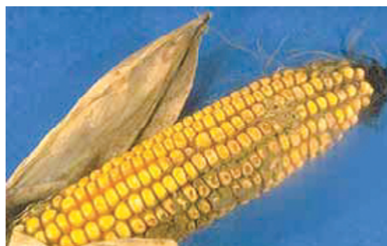
Figure 46.1 Aspergillus ear rot.

Mycotoxins are secondary metabolites produced by some fungi that are highly toxic to humans and animals. Consequently, the presence of mycotoxins can raise serious concerns if allowed to enter the food chain. Some fungal pathogens infect corn ears and cause ear rots/ molds and in addition to reducing corn yield, produce the mycotoxins. Mycotoxin consumption in livestock can lead to reduced intake or feed refusal, altered endocrine system, suppressed immune function, and other effects. Corn showing symptoms of fungal infections that produce mycotoxins should be sampled and sent for laboratory analysis. Production of mycotoxins starts in the field, and may continue during the storage period, depending on storage conditions. Mycotoxin levels never decrease during storage, but concentrations may increase if grain is not stored correctly.