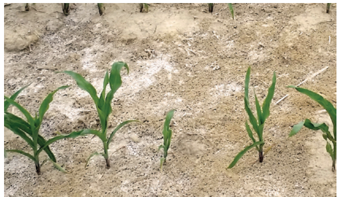
High sodium levels in the soil have stunted the growth of these corn plants by restricting water uptake.

Any salt in the soil can limit plant growth if present in high enough concentrations, but not all salts behave in the same way in the soil. Salts like potassium and calcium in the soil help to maintain soil structure. Sodium behaves differently than other salts in the soil because it has a tendency to disperse soil particles. As the sodium levels in a soil rise, the soil structure begins to change or even break down. When a lot of sodium is present in the soil, the soil structure may even be damaged so much that water will no longer percolate through the soil. Soils with high sodium levels inhibit plant water uptake, but also experience drainage and erosion problems. Because of this, soils with high sodium content (often referred to as sodic soils) are much more difficult to remediate than soils that have accumulations of other salts—even though both make growing plants difficult or impossible.