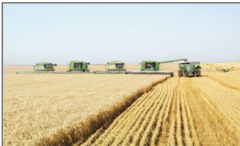
Figure 1.1. A wheat field with a very high yield potential. Producing fields that look like this requires an attention to details.

justify, or make impractical, additional inputs or practices that could further enhance yield. A list of key management practices needed to achieve 100+ bu/acre wheat yields are discussed in the iGROW wheat manual.